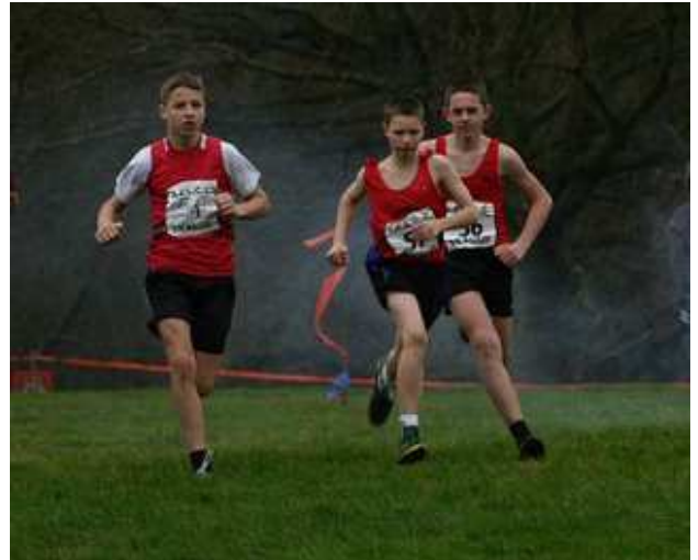
Horwich U15 boys battling it out at Boggart Hole Clough.